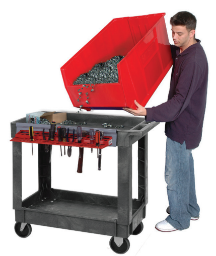
Warehouses & Manufacturing