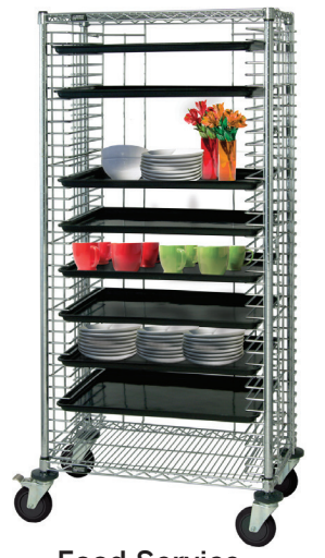
Food Service & Cafeteria