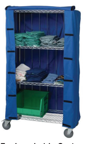
Enclosed-side Carts with Velcro Covers