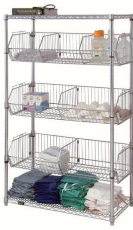
Wire Baskets for Dispensing